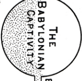
THE BABYLONIAN CAPTIVITY B.C.536